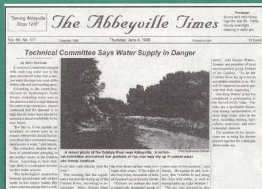
News article helps create simulated dispute for "Conflict on the Culebra!"