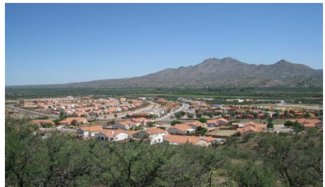
Santa Cruz River valley at Rio Rico, Arizona