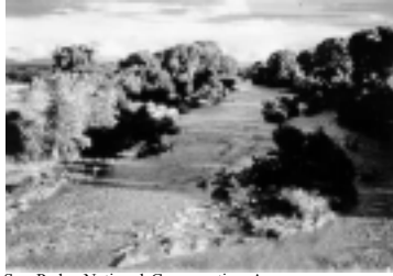
San Pedro National Conservation Area

The study aimed to identify stakeholder perspectives and concerns regarding the water policy and water management in the basin for the use of both local governments